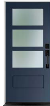
VistaGrande® 3/4 Lite with SDL