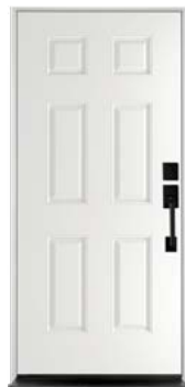
Belleville® 6 Panel