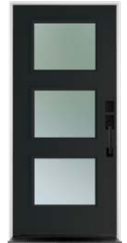
Belleville® 3 Lite Equal Modern