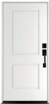
Belleville® 2 Panel Square