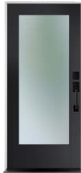
VistaGrande® Full Lite