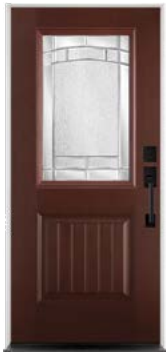
Belleville® 1 Panel Plank Half Lite