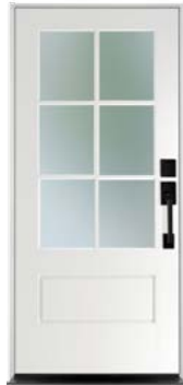
VistaGrande® 3/4 Lite with SDL