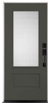
Belleville® 1 Panel 3/4 Lite