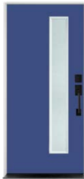
Belleville® 1 Right Side Vertical Lite Modern