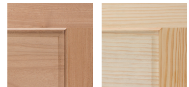
► Mahogany ► Pine