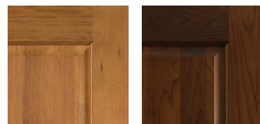
► Fir ► Maple