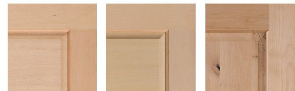
► Fir ► Hemlock ► Knotty Alder