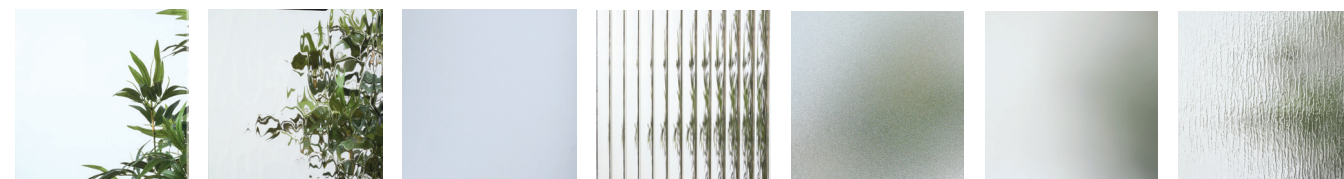
► Clear ► Flemish ► Frosted ► Narrow Reed ► Pear ► Satin Etch ► Rain

Additional door designs and glass options available at durastyle.masonite.com