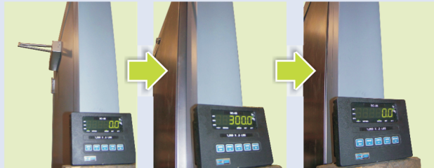
STANDARD DOOR at its resting state.