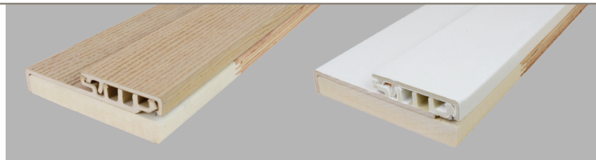
Textured Stainable Finish

FusionFrame ™ is available with a textured stainable or smooth, prefinished, paintable white finish, delivering the convenience of a field-ready product or the freedom to finish however you please to meet your needs.